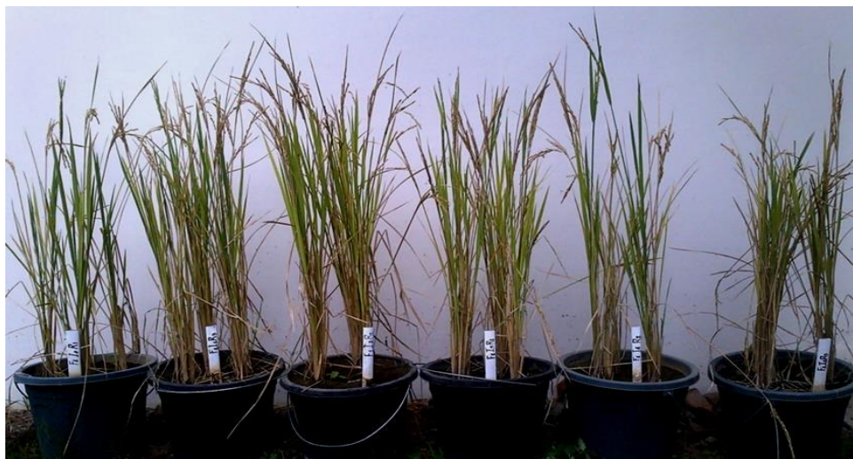
Fig.2. Upland rice as affected by inoculation with NB or1 , NB or2 , NQ b2 , NA yr1 , and NA o12 at 106 days after sowing (DAS).

It has long been known that rice can form natural associations with various nitrogen-fixing bacteria that are responsible for supplying the plants with fixed nitrogen (Gyaneshwar et al. , 2001). In this study, the enhanced growth observed in rice may be attributed to the ability of the endophytic bacteria to fix atmospheric nitrogen as well as produce growth promoting compounds such as IAA and ACC-deaminase. Figure 2 shows the effect of endophytic bacterial inoculation on the growth of upland rice at 106 DAS. According to Mendes et al. (2007), endophytes are known to promote plant growth by producing IAA which increases root size and distribution, resulting in greater nutrient absorption from the soil (Li et al. , 2008). In addition, they also produce ACC-deaminase which regulates the ethylene levels of plants and consequently contribute to a more extensive root system (Arshad et al. , 2007). However, Glick et al. (2007) stated that it is likely that IAA and ACC-deaminase stimulate root growth in a coordinated manner.